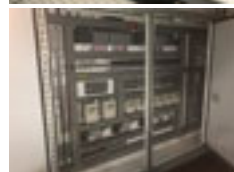
Automatic Loader and Unloader