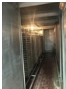
Pfening Rack Proofer