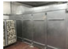
15 Door 15 Rack