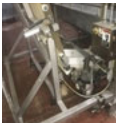
Accupan proofing and panning system