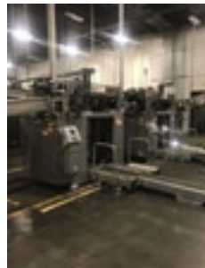
Lok Metal Detector