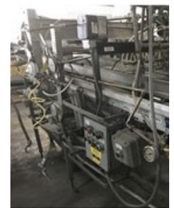
Burford Mandrell Seeder