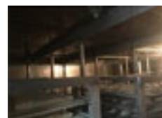
Racks Galvanized Construction 16 Shelf