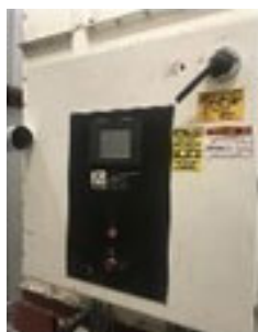
2 Pfening Weigh Hoppers