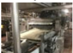
AMF Divider & Rounding Table