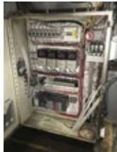
Stewart Pan Unstacker