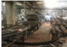
2 000 dozen per hour