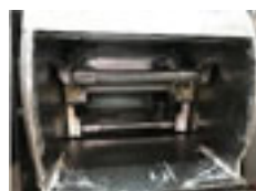
Shaffer 1 000 pound Tilt Bowl Mixer Glycol