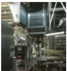
AMF Dough Elevator