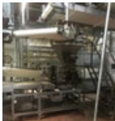
AMF KRDIIle and accupan 400 bun line