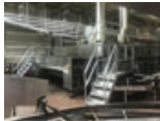
Baker Perkins 970 Tray Oven 23 Tray 32" Wide x 148" Deep