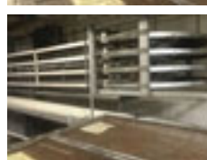
Stewart Racetrack Cooler