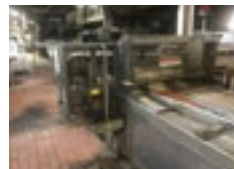
2 UBE 1216 Bun Bagger with Hinge and Band Slicer