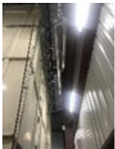
2 KB Indoor Silo 2 KB Rotary Sifter