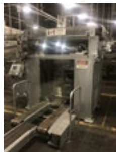
Stewart Pan Stacker