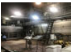
Stewart Racetrack Cooler