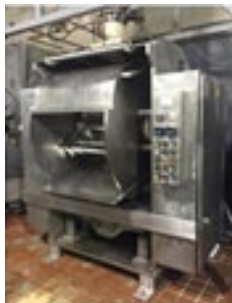
Shaffer 800 pound Tilt Bowl Mixer Glycol