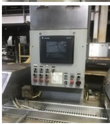
2 UBE 1216 Bun Bagger with Hinge and Band Slicer