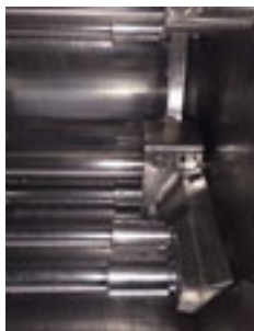
Shaffer 800 pound Tilt Bowl Mixer Glycol