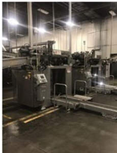
Lok Metal Detector