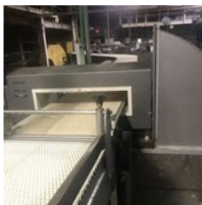
J-conveyor Discharge and Kwik Lok Tier