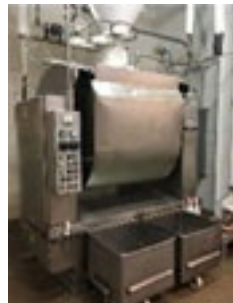
Shaffer 1 000 pound Tilt Bowl Mixer Glycol