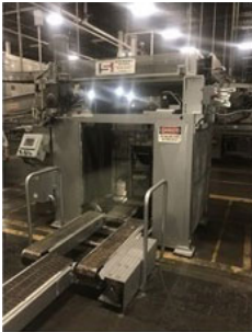
Stewart Pan Stacker