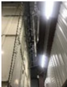
2 KB Indoor Silo 2 KB Rotary Sifter