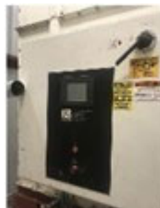
2 Pfening Weigh Hoppers