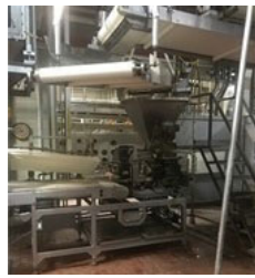
AMF KRD11e and Accupan