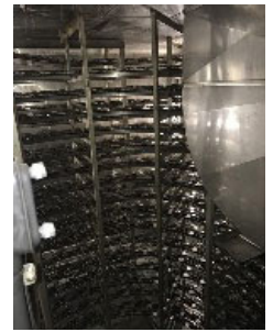
Stewart Proofer Rebuilt