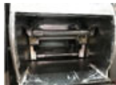
Shaffer 1 000 pound Tilt Bowl Mixer Glycol