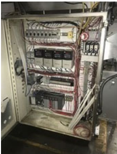
Stewart Pan Unstacker