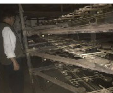
Stewart Oven Rebuilt